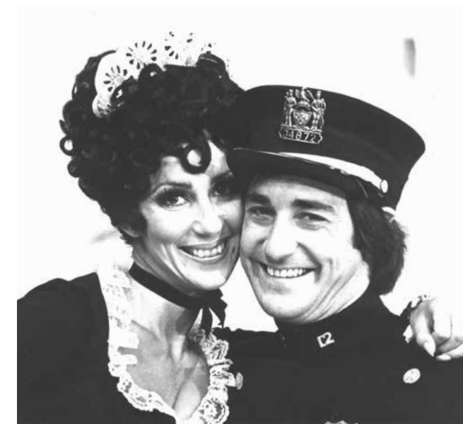
CHER AND PETER CULLEN

"He had seen some very serious battles that changed him," Cullen recalls. "He gave me the advice for Optimus Prime: 'Peter, if you're going to be a hero, be a real hero. Don't be a Hollywood hero.' He said 'Don't go yelling and screaming. He's strong enough to be gentle.' And that resonated with me, and I could hear his voice all the way to the audition. When he drops down, when he gets serious, is where I found Optimus Prime."