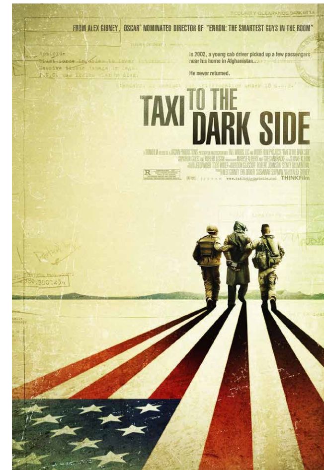
TAXI TO THE DARK SIDE POSTER

Ah, funding, now there's the rub. Fortunately, Gibney began making films at a moment when there was a new appreciation for auteur documentaries thanks to such popular works as Errol Morris's The Thin Blue Line , Steve James's Hoop Dreams and Werner Herzog's Grizzly Man . These films demonstrated that "there were no rules,"