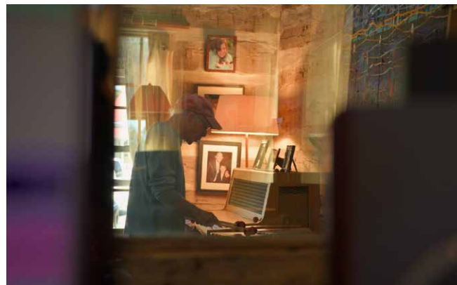
IN RESTLESS DREAMS: THE MUSIC OF PAUL SIMON

Gibney’s output about musicians and musical styles includes the