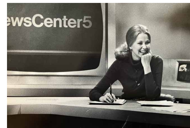
JANE PAULEY AT WMAQ CHICAGO'S NEWSCENTER5

During Pauley’s tenure, Today — along with its ratings rival, ABC’s Good Morning America — also evolved to define the morning news programming format for decades to follow, enduring today — particularly