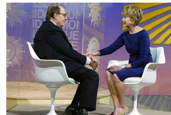
FAREWELL TO CHARLES OSGOOD ON CBS SUNDAY MORNING