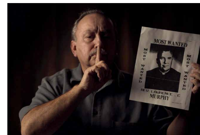
MEA MAXIMA CULPA: SILENCE IN THE HOUSE OF GOD