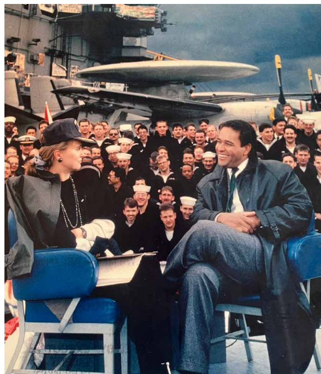
JANE PAULEY AND BRYANT GUMBEL ON THE USS CORAL SEA ON THE TODAY SHOW