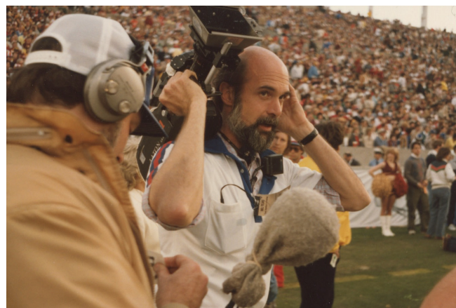
SUPERBOWL 2001 FOR HBO