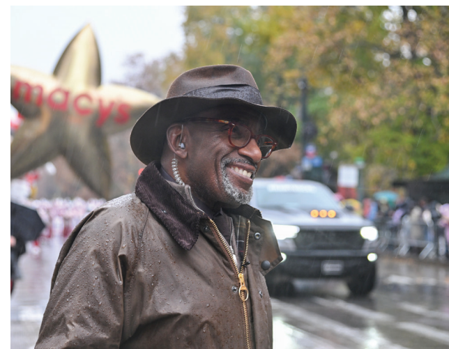
AL ROKER IS ONE OF THE HOSTS FOR THE MACY’S THANKSGIVING DAY PARADE

Roker’s broadcasting talent has always been his ability to make the science of weather both serious and joyful. While he downplays his own technical credentials — “I’m not a meteorologist,” he says with a grin — he has long championed presenting weather with both scientific rigor and emotional clarity.