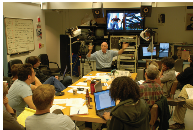
TEACHING AT U. C. BERKELEY SCHOOL OF JOURNALISM

He’d also remind himself of something less obvious: “You need a high tolerance for uncertainty. We don’t make boring films. But the price we pay is unpredictability — about what’s coming next, what story will find us, or whether we’ll find work at all. I’ve had just as many projects fail as succeed. But I never considered doing anything else.” ●