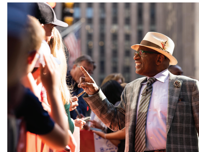
AL ROKER CONNECTS WITH THE AUDIENCE DURING A TAPING OF THE TODAY SHOW