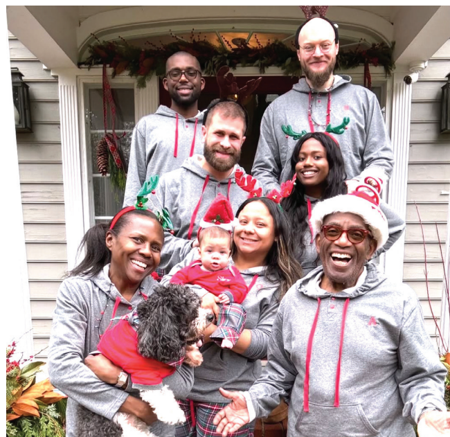
AL ROKER AND HIS FAMILY CELEBRATE THE HOLIDAYS