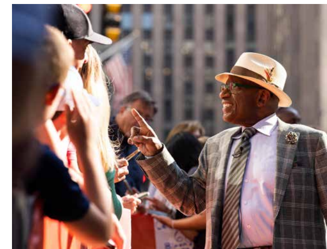
AL ROKER CONNECTS WITH THE AUDIENCE DURING A TAPING OF THE TODAY SHOW