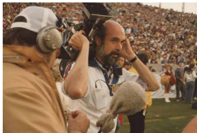
SUPERBOWL 2001 FOR HBO