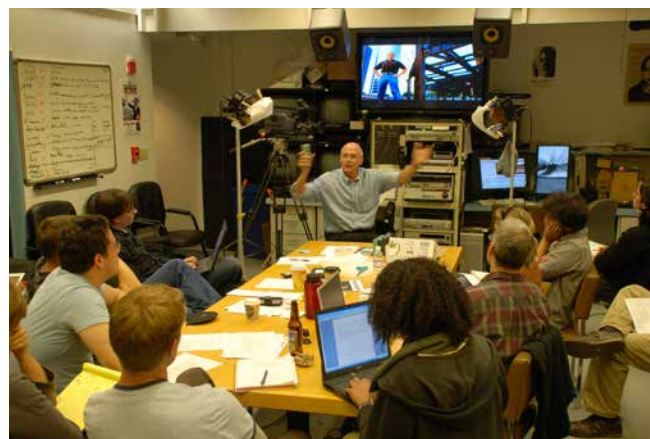
TEACHING AT U. C. BERKELEY SCHOOL OF JOURNALISM

He’d also remind himself of something less obvious: “You need a high tolerance for uncertainty. We don’t make boring films. But the price we pay is unpredictability — about what’s coming next, what story will find us, or whether we’ll find work at all. I’ve had just as many projects fail as succeed. But I never considered doing anything else.” ●