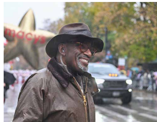
AL ROKER IS ONE OF THE HOSTS FOR THE MACY’S THANKSGIVING DAY PARADE

Roker’s broadcasting talent has always been his ability to make the science of weather both serious and joyful. While he downplays his own technical credentials — “I’m not a meteorologist,” he says with a grin — he has long championed presenting weather with both scientific rigor and emotional clarity.