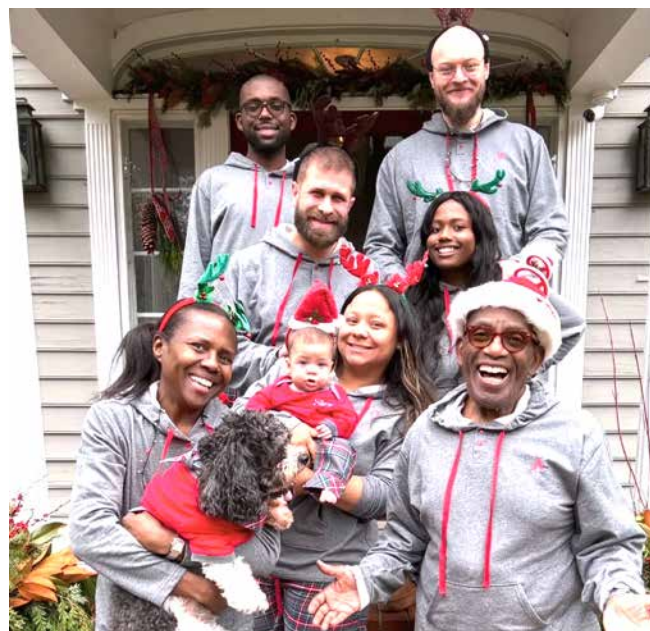
AL ROKER AND HIS FAMILY CELEBRATE THE HOLIDAYS